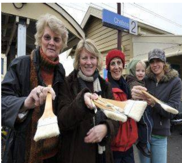
Photo from Chelsea Mordialloc Leader promoting the CBTS Arts Committee!